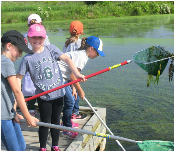
5th Grade Camp