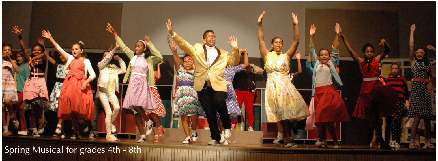
Spring Musical for grades 4th - 8th