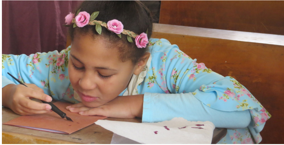
3rd Grade Field Trip to the Ohio Historical Society