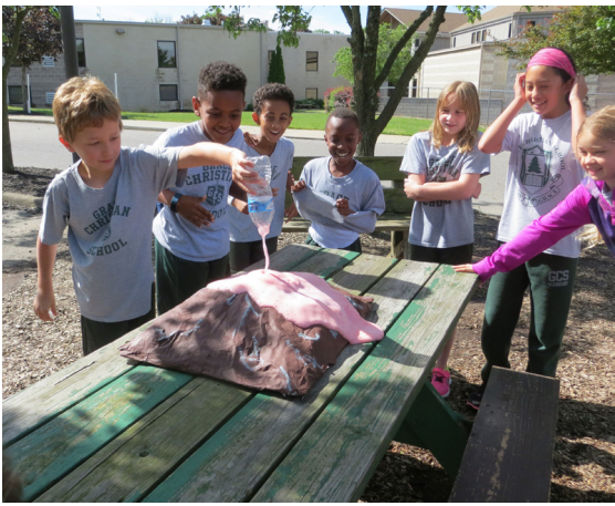
3rd Grade Science Experiments