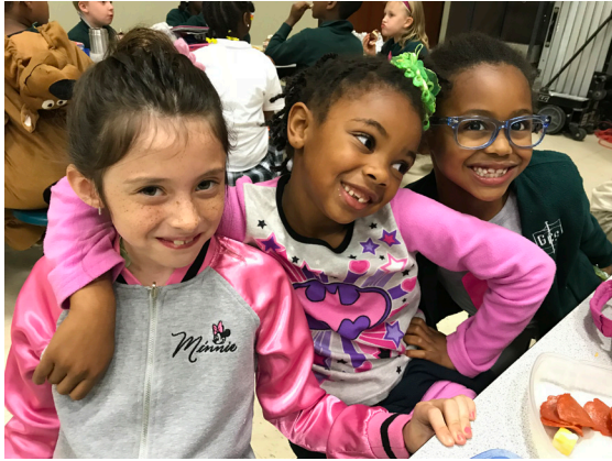
2nd Grade Book Character Day