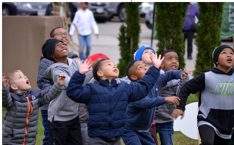
Football at the Food Trucks & Fellowship Festival