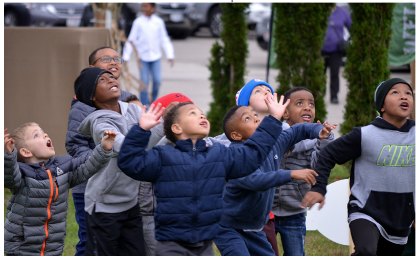
Football at the Food Trucks & Fellowship Festival