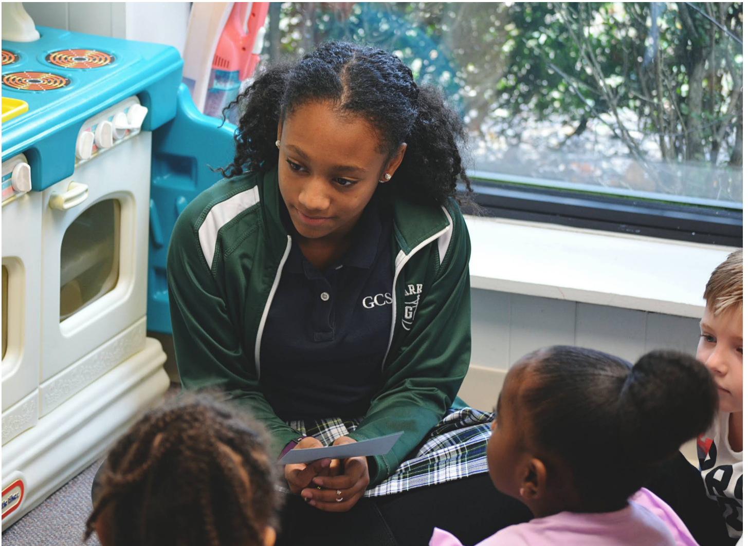
Middle School Student leading a discussion and prayer time with our preschoolers