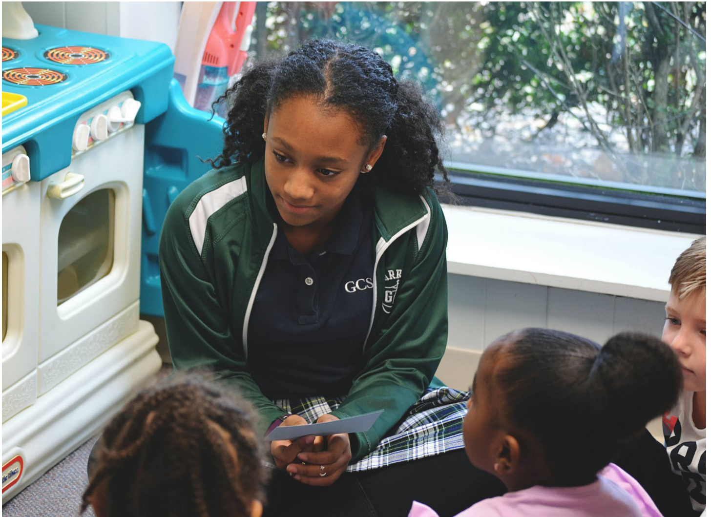
Middle School Student leading a discussion and prayer time with our preschoolers