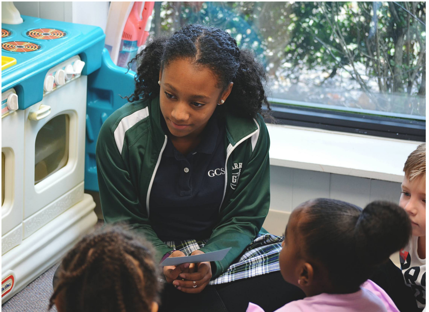
Middle School Student leading a discussion and prayer time with our preschoolers